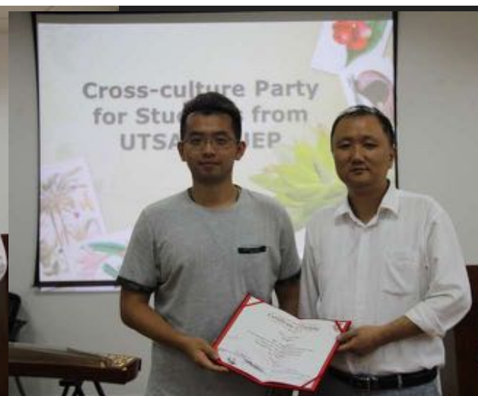
Receiving plc certificate