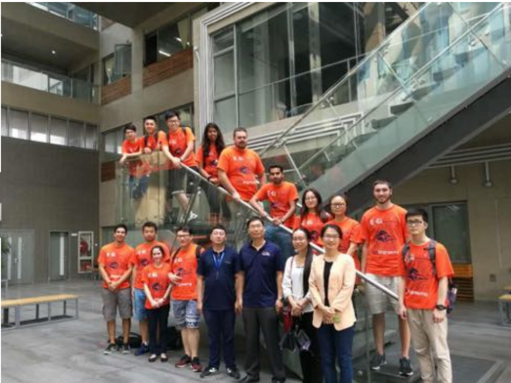
Field trip to Tongji University