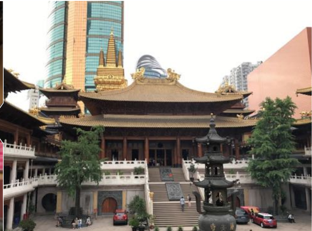
Viewing temples in Shanghai